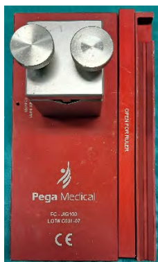
Cat. No.: FC-JIG100